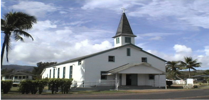
St. Roch Church

email: strochi@gmail.com * Website: www.strochkahuku.com * Facebook: facebook.com/kahukuhawaii