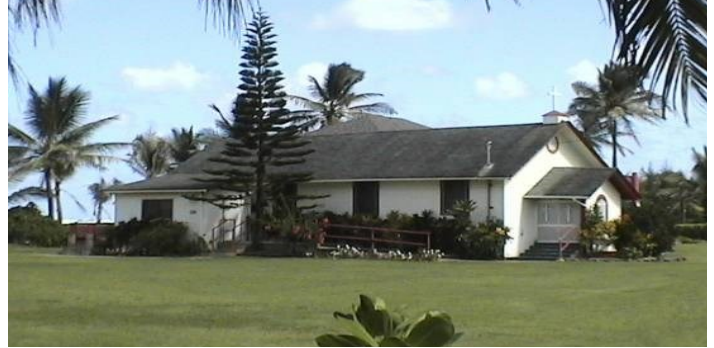
St. Joachim Church

Sunday Mass 7:30am Sunday Healing Mass 9:30am Daily Mass (Tues-Fri) and Communion Service (Mon) 9:00am