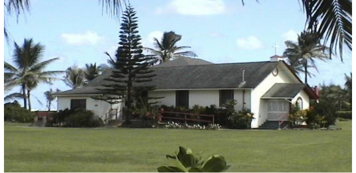
St. Joachim Church

Sunday Mass 7:30am Sunday Healing Mass 9:30am Daily Mass (Tues-Fri) and Communion Service (Mon) 9:00am