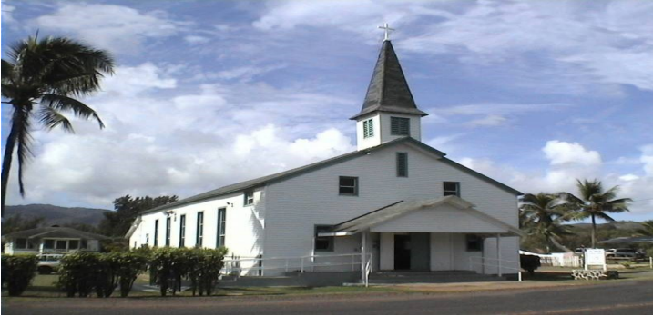
St. Roch Church

email: strochhi@gmail.com * Website: www.strochkahuku.com * Facebook: facebook.com/kahukuhawaii