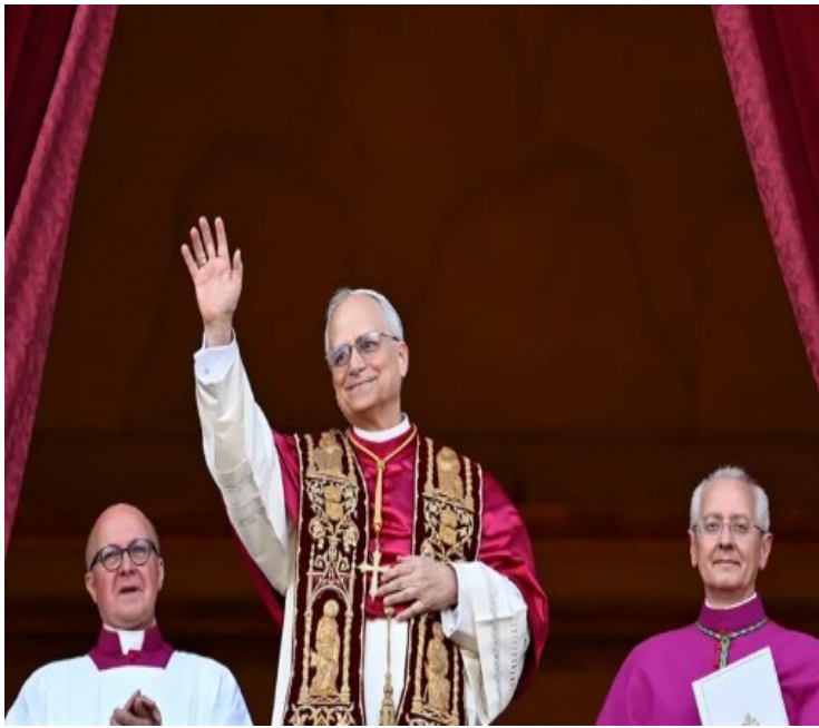
It's a moment of joy for the church. A new pope has been chosen. St Roch Parish joins in the celebration of the election of our new Holy Father, Pope Leo XIV.